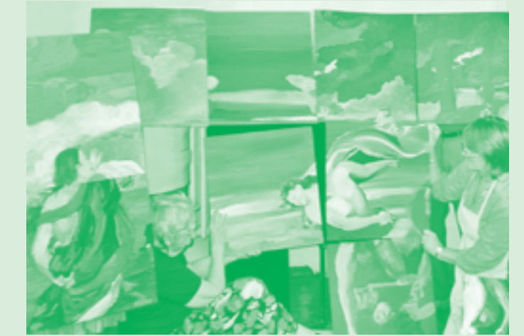
A previous "big picture"

Thursday, 28 September 10.00 am - 5.00 pm Connaught Centre, Connaught Road, Hove (off Church Road, Hove, near Tesco)