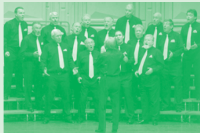
Sussex Barbershop Singers, National Small Chorus Champions 2006 on the competition stage

Have you ever thought of joining a choir or art club or theatre group?